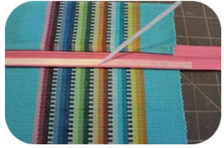
2. After the piece has cooled completely, peel the paper strip off exposing a sticky surface.