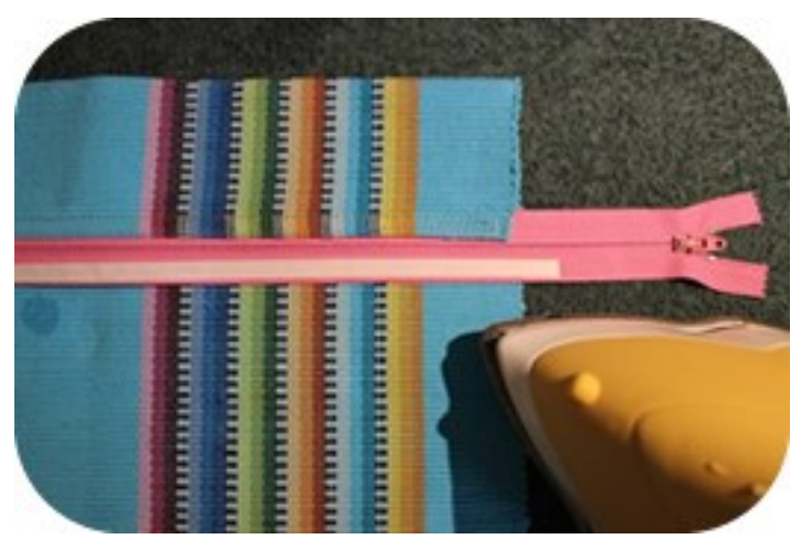
1. Cut a piece of Appli-Stick 1/4" tape to the desired length and fuse into place with your iron using a medium/high temperature and hold the iron to the tape for at least 3 seconds.