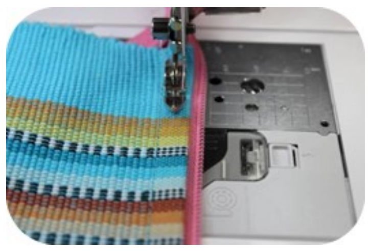
3. Position fabric over the sticky surface of the tape and stitch in place without having to pin, or the fear of shifting.