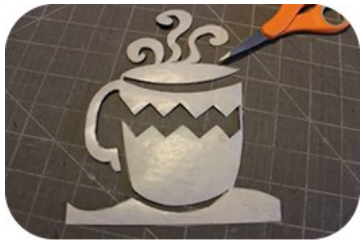
2. Once the fused piece has cooled completely, cut design out.