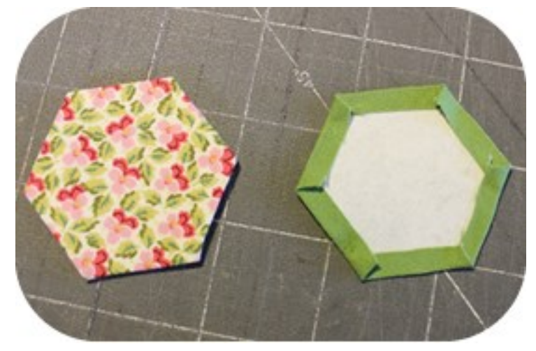
4. Turn the fabric so that it sticks to the glue.