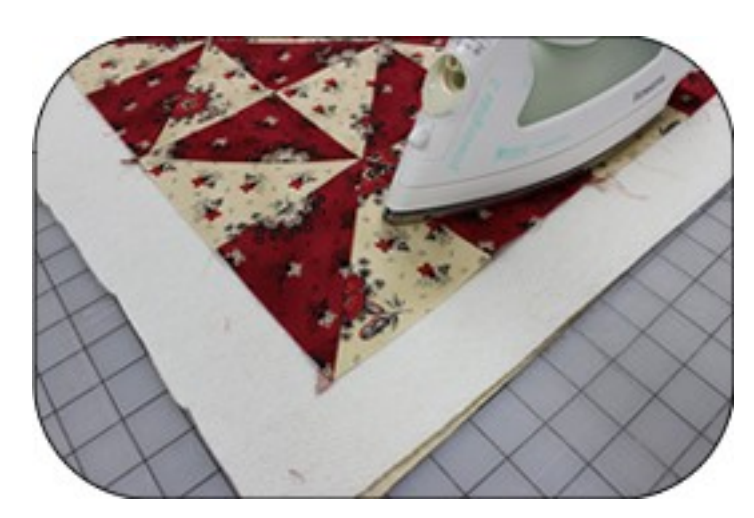
3. After the fabric is adhered, flip over the batting and repeat the process if desired with the top of the quilt. No Pinning!