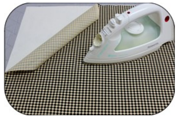
2. Press evenly, one section at a time and let cool to room temperature before advancing. If there's a wrinkle in the fabric it should separate from the batting with moderate resistance. Simply repeat the mist and iron process.