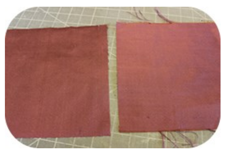
3. Notice in the picture the difference between the two pieces of silk. Select Fabric Prep was applied to the square on the left. After handling the pieces for a few minutes the square on the right has begun to ravel.

Many times we will have heavy embellishments or maybe a stitch intensive embroidery design on our projects that tend to cause distortion or puckering.