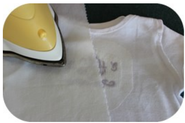
Apply to fabrics that have a tendency to fray or ravel easily while working with them.