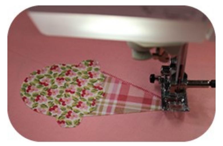
2. Stitch or embellish as desired.