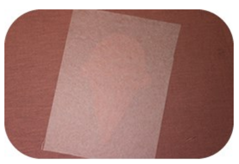
1. Cut a piece of Select TearAway slightly larger than the area to be stitched or embellished. Place the shiny side of the stabilizer to the wrong side of the fabric. Cover the stabilizer with a pressing cloth or piece of cotton. Using a medium setting(wool) on your iron, press into place. Let the stabilizer cool before handling.