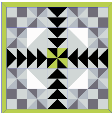
Figure 1 Pinwheels are constantly in motion