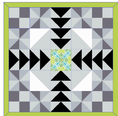
Figure 3 Fussy Cutting a single fabric is quick and easy

The center block unit is 8 1/2" x 8 1/2" (8"x8" finished). Which block will you pick?