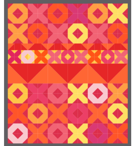
Be Still Layout