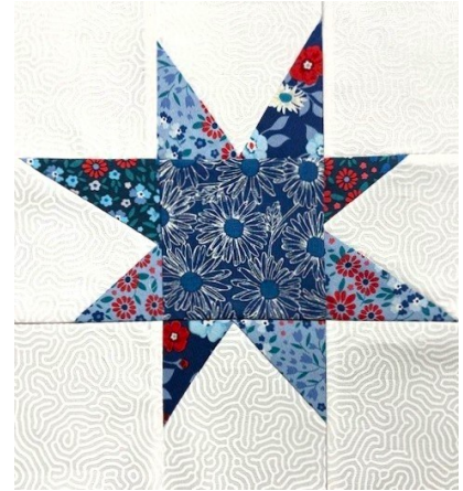
WonkyBlock 12" finished blocks